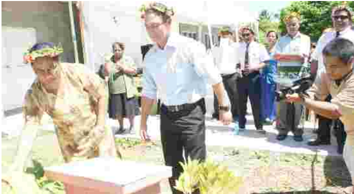
Hon. Teima Onorio, (L) and the New Zealand High Commissioner, Mike Walsh unveiling the BTC's Anniversary commemorative plaque

The Betio Town Council held its 40 th Anniversary celebration and Open Day on Tuesday, 30 May 2012, the date of its establish-