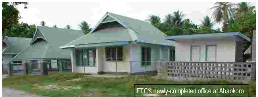
ETC’s newly-completed office at Abaokoro

On a related matter, ETC is embarking on an “Integrated Income Generating Project” comprising hardware supplies, a computer network system and the setting up of a Reserve Fund for the Council, that will be invested offshore with the returns used to supplement the Council’s income.